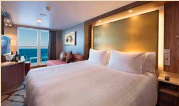
BALCONY / BALCONY DELUXE STATEROOM From 20 sq.m From 22 - 28 sq.m Max Occupancy 3 - 4 Max Occupancy 3 - 4 Deck 8/9/10/11/12/13/15 Deck 8/9/10/11/12/13/15 1 Queen-size Bed + 1 Queen-size Bed + 1 Single Sofa Bed/ 1 Single Sofa Bed/ 1 Single Sofa Bed + 1 Single Sofa Bed + 1 Ceiling Pullman Bed 1 Ceiling Pullman Bed