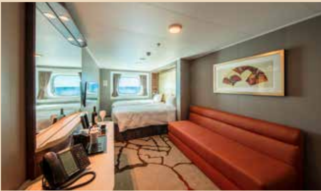
OCEANVIEW STATEROOM From 16 - 35 sq.m | Max Occupancy 2 - 4 | Deck 5/9/10/11/12/13 2 Single Beds/ 2 Single Beds + 1 Single Sofa Bed/ 2 Single Beds + 1 Single Sofa Bed + 1 Ceiling Pullman Bed