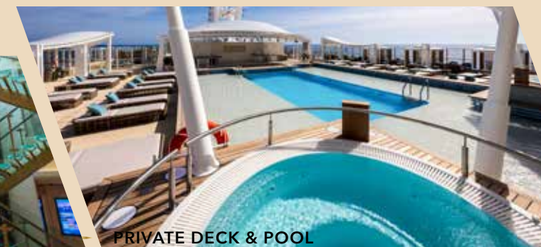
PRIVATE DECK & POOL