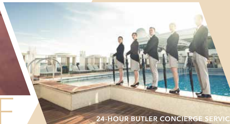
24-HOUR BUTLER CONCIERGE SERVICE