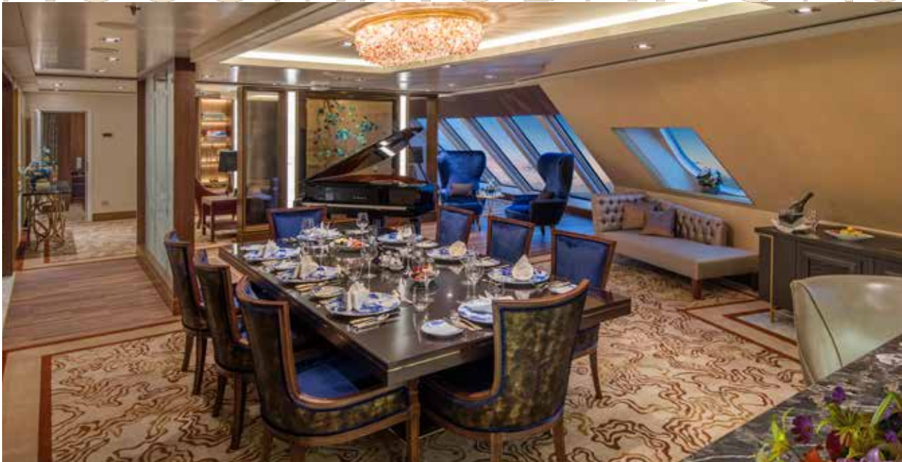
PALACE VILLA Approx. 224 sq.m | Max Occupancy 6 | Deck 17 1 King-size Bed + 1 Queen-size Bed + 1 Double Sofa Bed