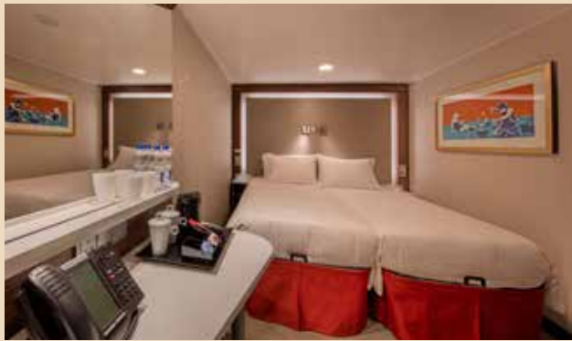
INTERIOR STATEROOM From 13 - 14 sq.m | Max Occupancy 2 - 4* | Deck 5/8/9/10/11/12/13/15 2 Single Beds/ 2 Single Beds + 1 Ceiling Pullman Bed/ 1 Single Bed + 1 Pullman Bed + 1 Double Sofa Bed