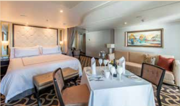
PALACE DELUXE SUITE From 41 sq.m | Max Occupancy 4 | Deck 15 1 Queen-size Bed + 1 Double Sofa Bed