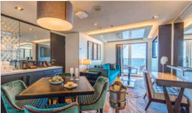
PALACE DELUXE PREMIUM From 41 - 61 sq.m | Max Occupancy 4 | Deck 9/10/11/12/13/15 1 King-size Bed + 1 Double Sofa Bed