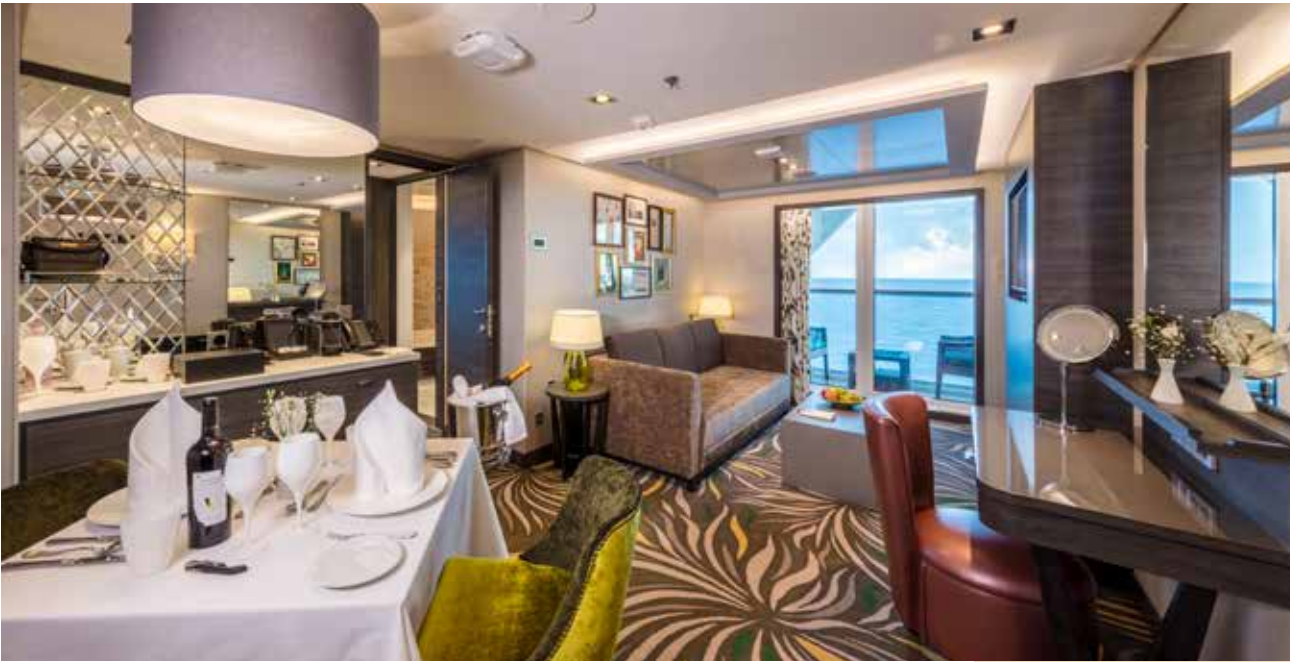
PALACE PENTHOUSE Approx. 56 - 115.4 sq.m | Max Occupancy 4 - 6* | Deck 13/16 1 King-size Bed + 1 Double Sofa Bed/ 1 Queen-size Bed + 2 Double Sofa Beds/ 1 Queen-size Bed + 1 Double Sofa Bed