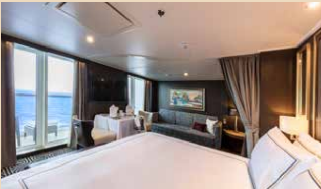
PALACE SUITE From 37 sq.m | Max Occupancy 4 | Deck 13/15/16/17 1 Queen-size Bed + 1 Double Sofa Bed